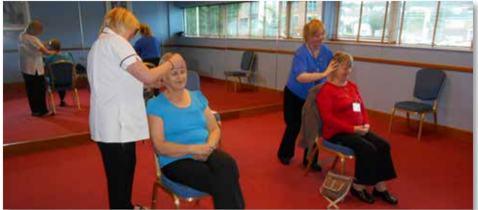
Therapies for our carers provided by TADS

The branch's thanks go to the sponsors of the goodie bags, Holiday Inn, Bannantyne Spa