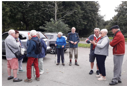
Dearne Valley Park