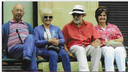
Relaxing at Brodsworth Hall

■ In Harewood House staff were again very helpful, providing transport around the grounds. However, the wheelchair lift providing entry to the house was out-of-order, so apologies go to members who were unable to see the State Rooms. We always try hard to ensure there is full access for everyone on our visits but, on this occasion, there had been a sudden unpredictable mechanical failure. Harewood is such a beautiful place and there is so much to see that hopefully no-one was too disappointed with the outing.