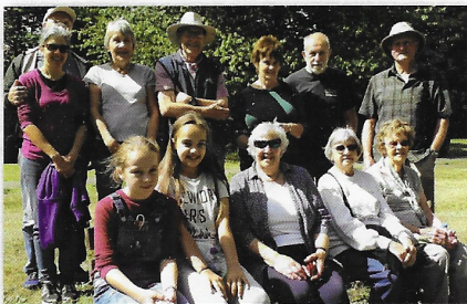
Walkers at Dearne Valley

The house itself is a time capsule and very interesting while the gardens have been restored to their Victorian splendour.